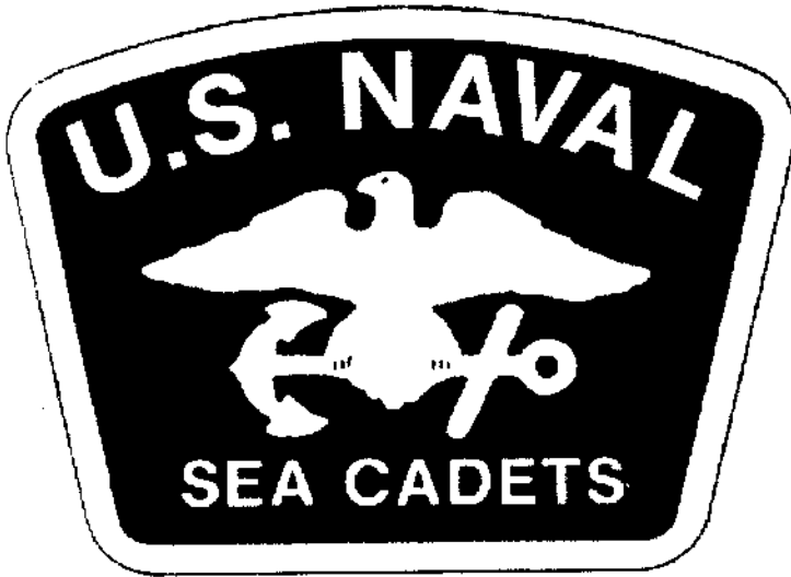
Official NSCC flash to be used for Ballcaps (Patch shown - Official Size - 3 & 3/4" W by 2 & 3/4" H) Unit Name may be placed under flash in small Sans Serif type