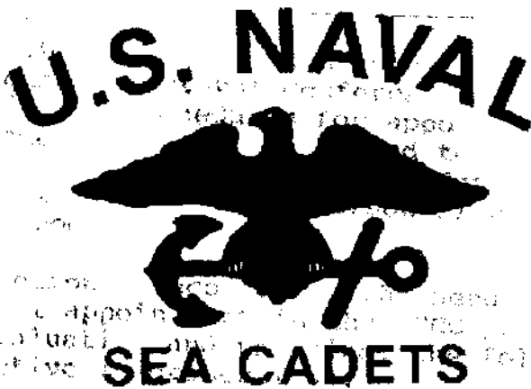
Flash, without border, is used for Polo Shirts Blue Flash with Grey or White Shirt Gold Flash with Navy Blue Shirt