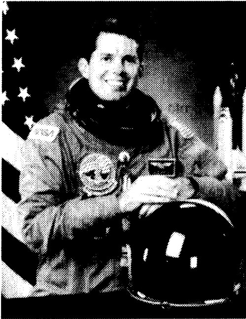
Captain David C. Leestma, USN (Ret.), NASA Director of Flight Crew Operations

"I remember joining the Navy League Cadet Corps when I was in the 8th grade and was living in Southern California. A close friend's father was one of the officers in the new unit and he convinced me to attend some of the first meetings. I enjoyed the discipline, the close order drill, the anticipation of receiving a uniform, and looked forward to actually sailing on a REAL Navy ship! We met in one of the old blimp hangars at the Marine Corps Annex in Tustin, California. It was a thrill for me to be able to get on the base. This was my first experience with the military service and it appealed to me.